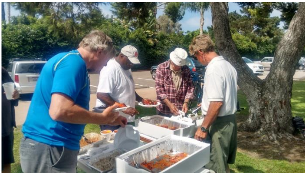
Saturday's BBQ was mighty fine.