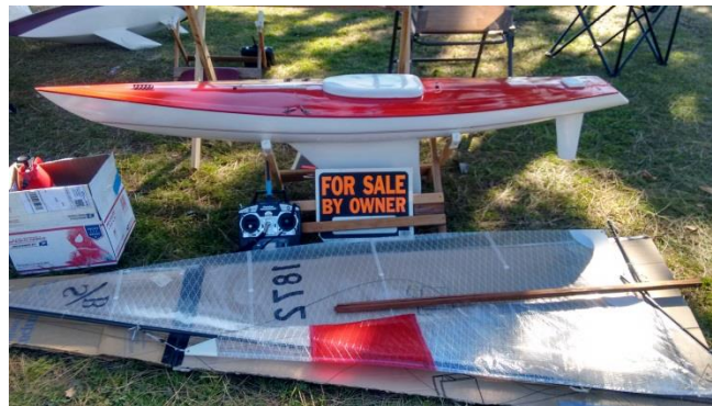
Red Santa Barbara for Sale

3 pair sails, 2 with rigging (sails with rigging in pics) 1 fancy box stand, 1 saw horse stand (both in the pics) Transmitter with extra set of crystals 2 battery chargers 2 old rechargeable battery packs parts and back issues of Model Yachting magazine.