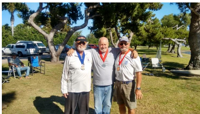
November Santa Barbara Winners